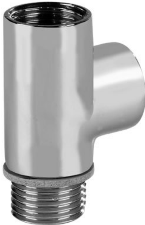
Dual Element Connector