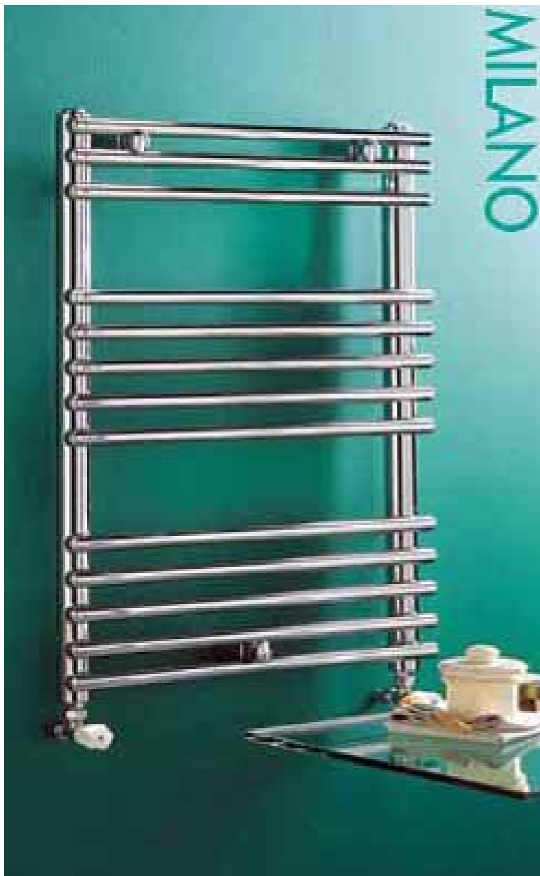
Milano 1738H X 600W Chrome Flat Towel Warmer