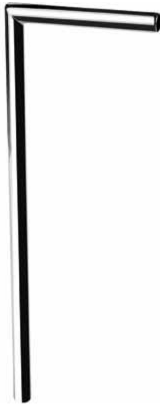
Mitred British Hand Made Waste Pipe