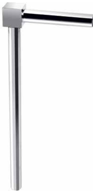
Square British Hand Made Waste Pipe